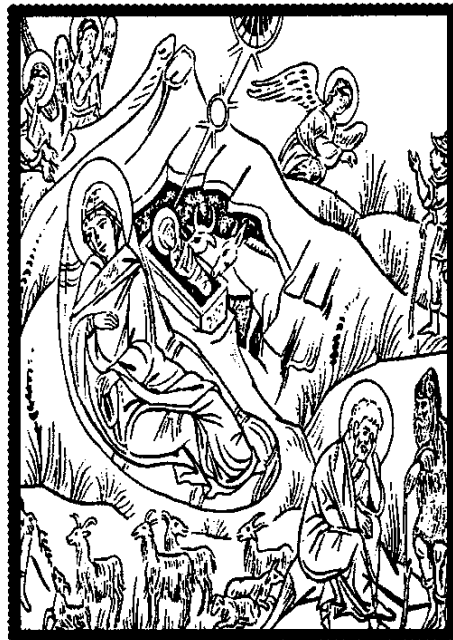
Nativity of Our Lord

Divine Liturgies at 8 a.m. and 10:30 a.m.; Summer 8 a.m. and 10 a.m.; Holy Day Vigil 7 p.m.