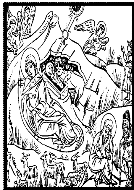
Nativity of Our Lord