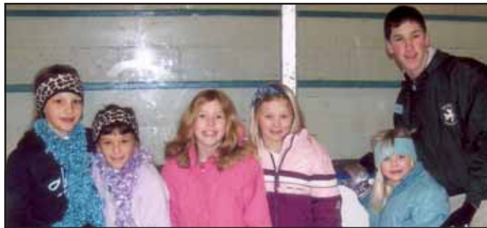
The ECF sponsored an ice-skating party at Twin Ponds East on Sunday, January 20. About 45 parish members enjoyed a great afternoon with their Church family.

HIGH SCHOOL AND COLLEGE GRADUATES: If you are going to graduate from high school or college this year, please give the following information to the rectory: your name, the school you attend, your degree, and your future plans. Thank you.